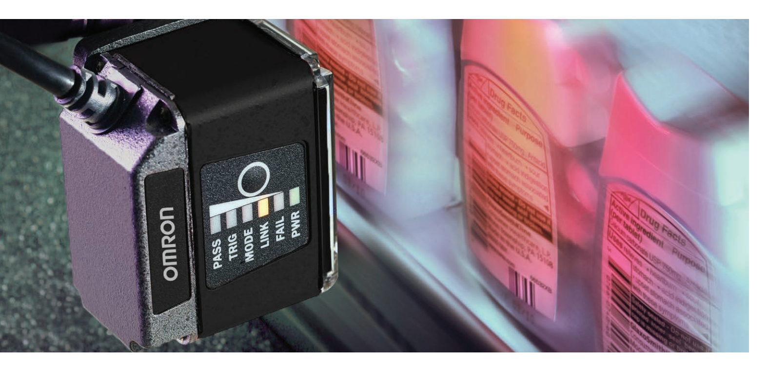
MicroHAWK industrial barcode readers are an integral part of Omron's overarching traceability solutions.

The MicroHAWK line is also incredibly easy to use. With the browser-based WebLink interface, these barcode readers read right out of the box with no software installation whatsoever. This "out-of-box experience" is a hallmark of an Omron solution, as Omron has even managed to make machine vision technologies such as its HAWK MV-4000 smart camera intuitive to the average user as well as to the expert.