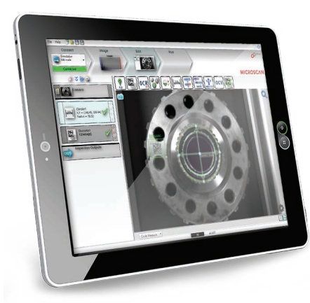
Omron MicroHAWK with weblink software for precision traceability and inspection solutions.

addressing specific challenges with advanced barcode reading, machine vision and DPM verification systems. Miniaturization, product longevity and ease of use are major themes in the design of new solutions for traceability in the medical industry.