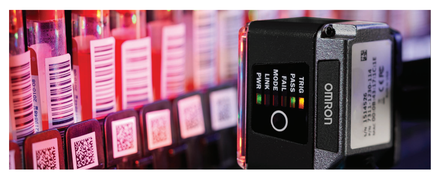
A MicroHAWK reads data from codes placed on test tubes.

Health Canada has similar regulations to the FDA UDI and GS1-Canada assists Medical Device Manufacturers with issuing UDIs which are used both in Canada and the US. GS1 has a Global Trade Identification Number (GTIN) which is a globally unique ID number which would allow a company to sell a product both in Canada and the US and keep the UDI information in both the FDA and the Health Canada databases.